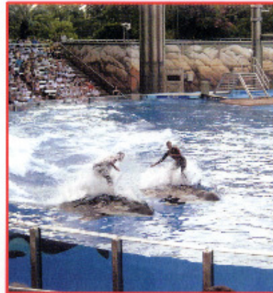
Approximate distance from our Villa in Minutes: